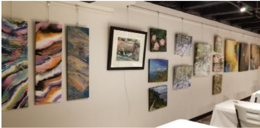
6 Lynda's art in the Cavan Gallery

She believes anyone facing a challenge can achieve whatever they want to. Sometimes modifications may need to be made to make that happen. Everything is possible. Including a blind woman creating visual, expressive and beautiful art.