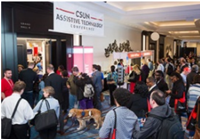
4 People entering the conference